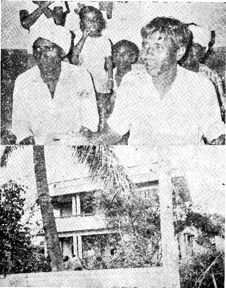
Top: One of the bonded labourers relating his tale of woe to KCLC member.