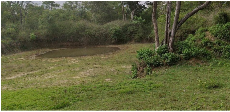
A view of Nagarahole

Bengaluru: Adivasi communities from Nagarahole Tiger Reserve slammed the environment activists for misleading the state government by portraying a tribal rights event organised at Nanachi gate as a cricket match and falsely accusing them of cutting trees.