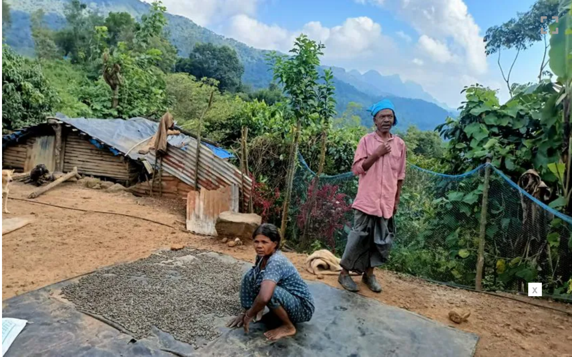
A tribal family in Attappady.

Nanchiyamma, who won the hearts of the entire Kerala folk through her song in the movie 'Ayyappanum Koshiyum', is also among the tribes who lost land.