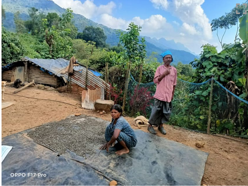
A tribal family in Attappady