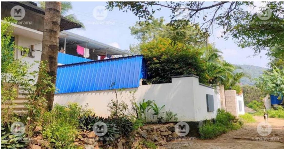
Dasannoor is one tribal hamlet that values self-esteem more than anything.