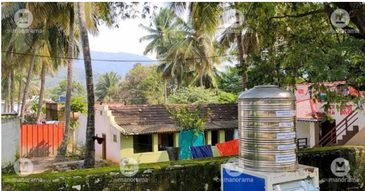
Dasannoor tribal hamlet in Sholayur Panchayat in Palakkad district has set a model worth emulating.