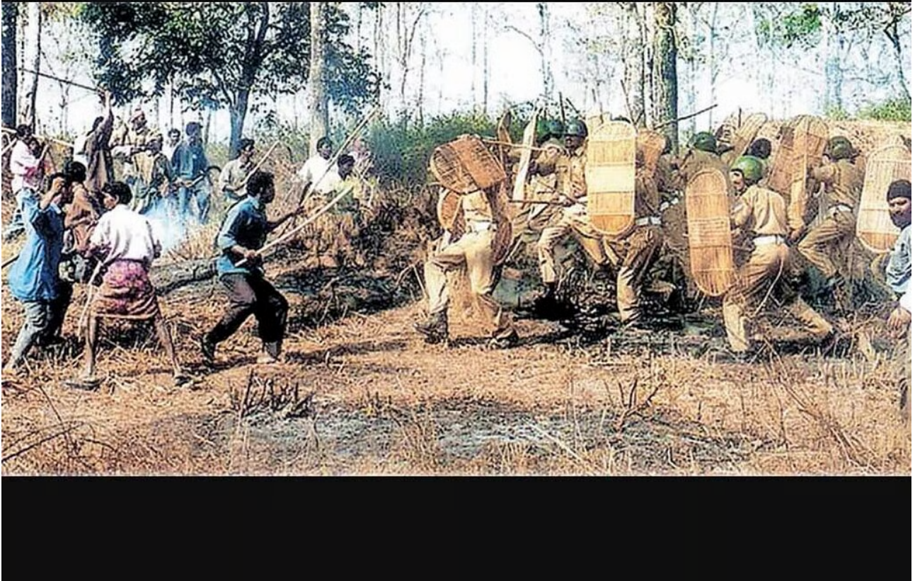
Scene from Muthanga protest in 2003 File pic

Despite claims of being progressive, Kerala is still rife with issues related to rights and dignity of Dalits and tribal people. How do you view this?