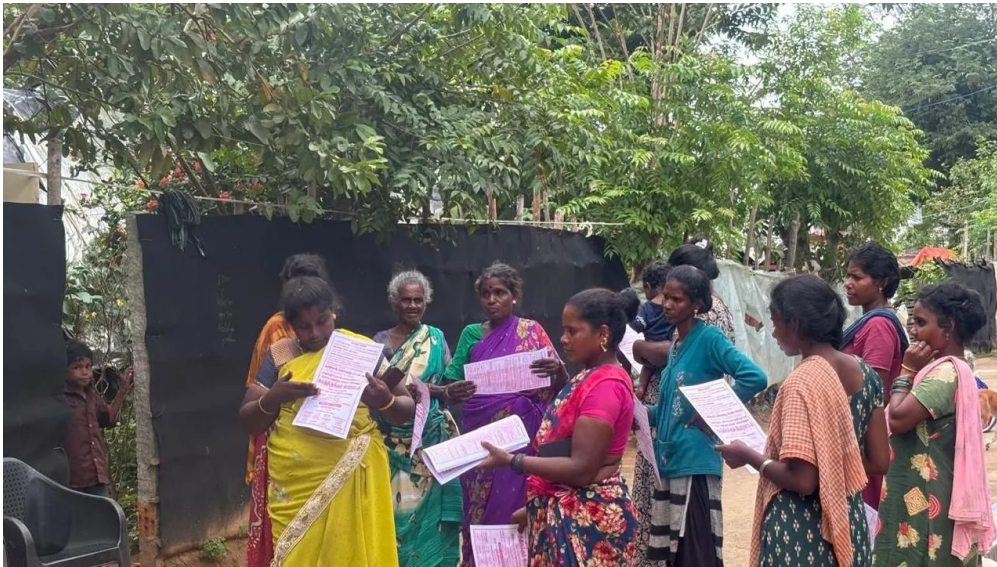
Members of Irular tribe in Tamil Nadu.

Synopsis: A South First investigation has revealed that lakhs of Adivasis in Tamil Nadu are at risk of disenfranchisement during the recent SIR of voter rolls. Most of them, illiterate and daily-wage labourers, lack even basic identity documents to prove that they are citizens of India.