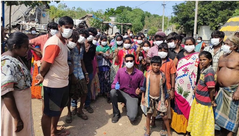
Narikuravars. Image for representational purposes only

https://www.newindianexpress.com/states/tamil-nadu/2022/Oct/02/tamil-nadu-kuravars-seek-inclusion-under-st-category-2504368.html