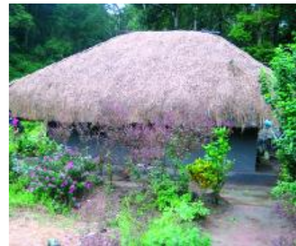
Life at stake: Thirty villages, most of them belonging to mountadan chetty community, have been waiting for relocation for more than five years.

UDHAGAMANDALAM: A long delay in the relocation process of forest dwellers and tribals living in 30 villages, including Mudhuguli village, located inside Mudumalai Tiger Reserve (MTR) in the Nilgiris, will cost the state nearly double the amount in compensation as the number of families in the villages has increased significantly in the past five years.