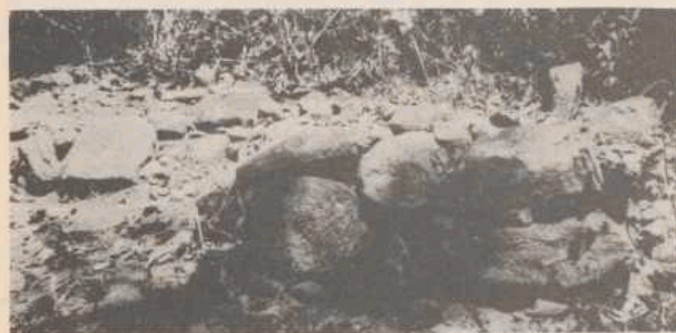
Fig. 9: Ālu Kuṛumba graves (Bāvi-ūru)

may also be marked in a different way, namely, by erecting, on top of them, rectangular earthen platforms of varying height (from about 20 to 80 cm.), the edges of which being formed by walls of unhewn stones; thus resembling the stone platforms which, at some areas, are used as alternatives or substitutes for dolmens (see 4.1).