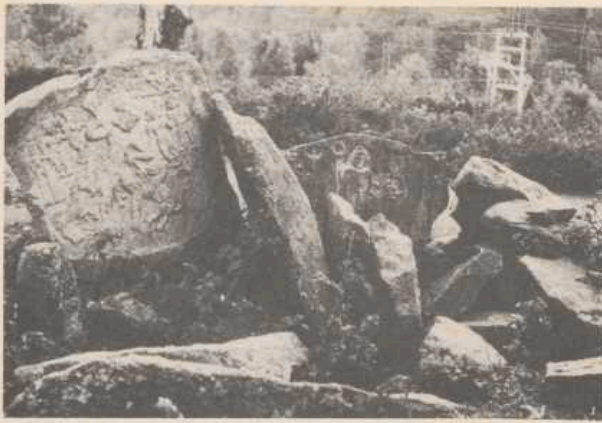
Fig. 8: Sculptured dolmens (Mēlūr)

ly deciphered as far as possible, does not throw much light on the history of the cromlechs. It is, he says, 'in Tamil, not at all old, the letters being rudely fashioned, but not essentially differing from those in common use. But the writer was a very ignorant person, and the spelling is barbarous. The end of each line has been broken off, and it is thus impossible to give a connected translation.