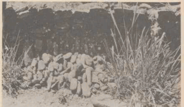
Fig. 7 b: Spot assigned to the Bēllega clan