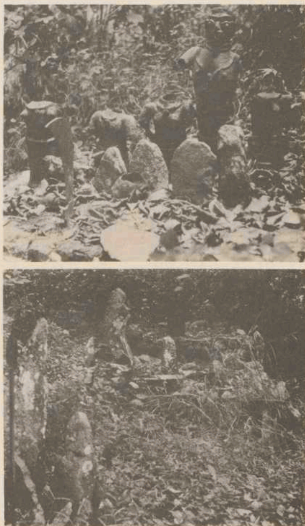
Fig. 13: Religious centre (Kenjukūru)

On the far left, there are aligned five (partly broken) clay images, obviously meant to represent an ancestress (Kuṛupaḍe-Tāyi?), with five upright stones standing before them. A long and curved (rusted) knife which must have been used ritually, for killing animals to be sacrificed, is fixed in the ground upright in front of the stones (see Fig. 13a).