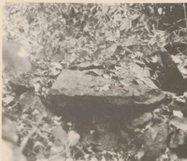
Fig. 4: The Toḍiki dolmen

Not far from the original Toḍiki, I was shown an old dolmen which was in a rather ruined condition (see Fig. 4). Its broken capstone was, on three sides, supported by several small stone slabs (broken remains of, originally, three stone slabs?), the front side being nearly totally closed by two stones. Whether any water-worn stones were in its interior, I am unable to say as I was not permitted by my guides to remove the front stones and have a look inside.