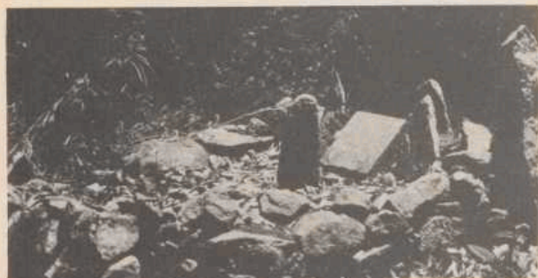
Fig. 10: Grave of a former Ālu Kuṛumba headman at a religious centre (Kenjukūru)

In the forest stretching above the ghat road not far from Barliyār, I came across the grave of a former Ālu Kuṛumba headman which is fashioned after the method described last. On the grave, there are three upright stones and at its head, a small stone plate into which the name of the deceased headman, Malla, had been engraved in Tamil characters (see Fig. 10).