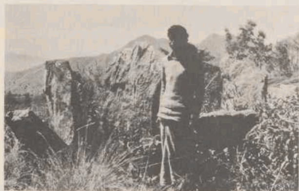
Fig. 14a: "Megalithic" prison (Niḍiṅgāl-ūru)