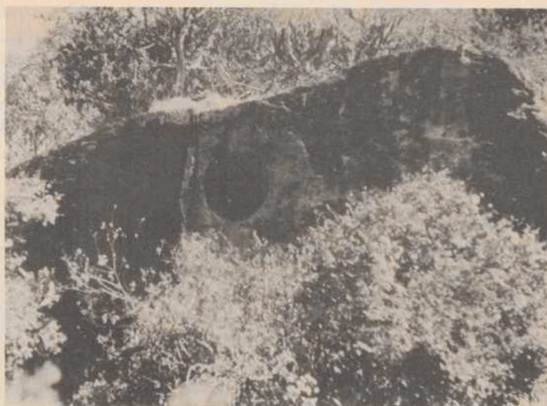
Fig. 12a: Rock, nearly totally hidden by a wild vegetation, with a cave below its summit containing a memorial statue (below Geddai)