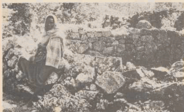
Fig. 2a: Remains of a corral for buffaloes (Mottāḍa)