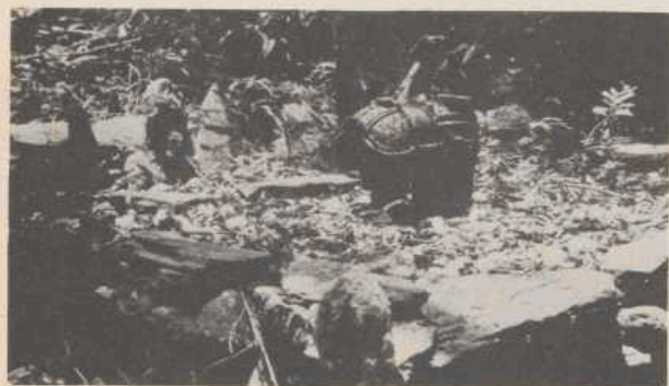
Fig. 13c: Platform with a clay horse and a trident planted on its top

Finally, on the far right, we find a low rectangular platform edged by stone walls on the top of which, right in its centre, there is a clay horse, now slightly broken. To the right of the clay horse, but near to the front wall, a (rusted) trident is fixed in the platform soil (see Fig. 13c).