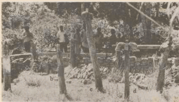
Fig. 7: gove-mane of Andi-are

From the present condition of this house-like structure, we may conclude that it must once have been covered by a thatched roof which was supported by the eight wooden