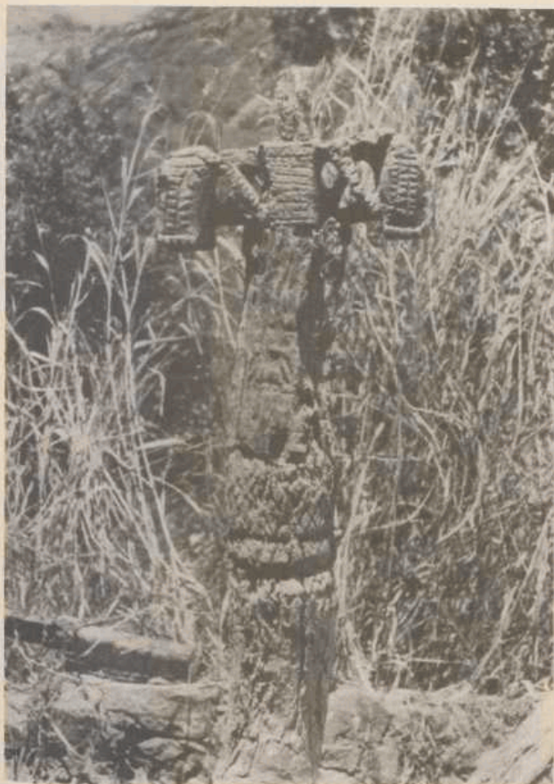
Fig. 7 a: Examples of wooden pillars with movable capitals (on the top of the precipitous rock in the background,