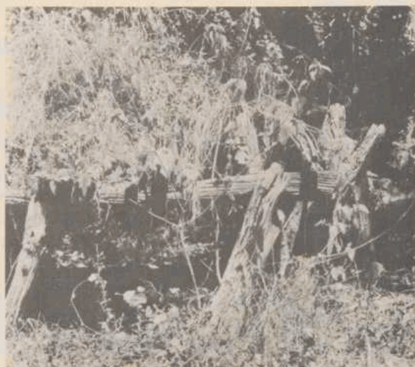
Fig. 3: Wooden memorial structure (Mottāḍa)

On my inquiries, my Ālu Kuṛumba guides informed me that this structure was erected in memory of a priest who, on this spot, first had killed his wife, then himself during one disastrous night in the last century, in order to escape the murderous hands of Todas and Baḍagas who had come to kill him and his wife, after they had cruelly slain all the inhabitants of the hamlet of Mottāḍa, under the pretext of their being sorcerers. 54