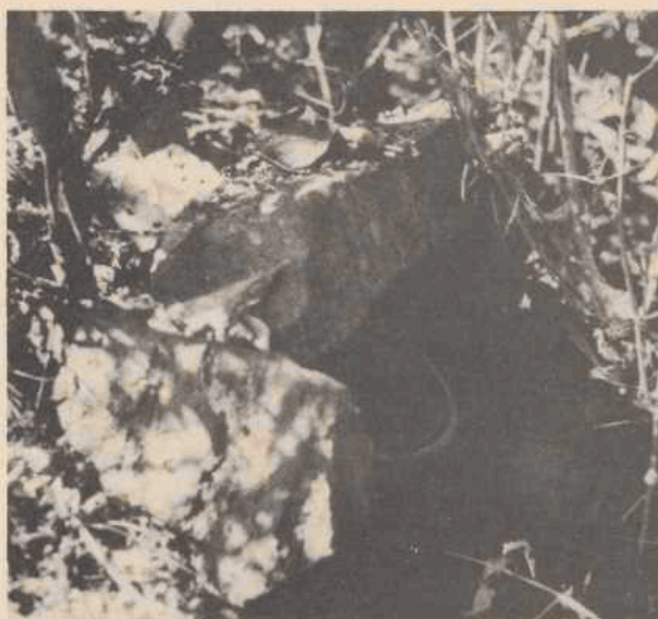
Fig. 5: Miniature dolmen with aluminium cups which contained drink offerings (Cēmbugēre)

Since miniature dolmens which only function as depositories for food and drink offerings to the departed spirits, are, as a rule, found only in the vicinity of stone platforms, it is obvious that, in those areas where stone platforms are used in the function of dolmens of the