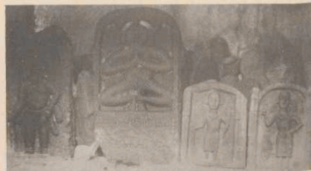
Fig. 1 a: The Bāvi-ūru dolmens