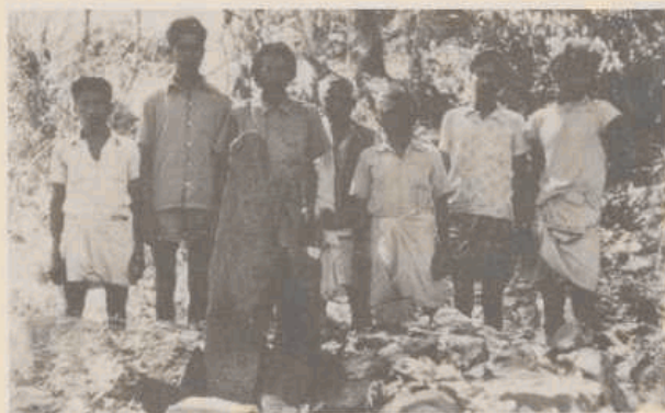
Fig. 11: Grave of the founder of Cēmbugēre and his wife with two tall stones one of which showing the crude engraving of a human being, with Ālu Kuṛumbas

A similarly built grave site, however, with higher walls, I was shown on the outskirts of the Ālu Kuṛumba hamlet of Cēmbugēre. The grave is located on a small level ground which interrupts a steep jungly mountain slope. As this site was (and is) regularly used by a herd of wild elephants as a resting place, the grave was in great disorder when I inspected it in 1975. Two tall stones lay flat on the top of the destroyed grave, the taller of which showing the very crude engraving of a human being (see Fig. 11). (As soon as we had reached the site, my guides at once set themselves to restore the original condition of the grave). According to the statements of the then headmen of Cēmbugēre, these stones had been planted on top of the grave in memory of a forefather ranking as the founder of Cēmbugēre, and his wife who were buried there.