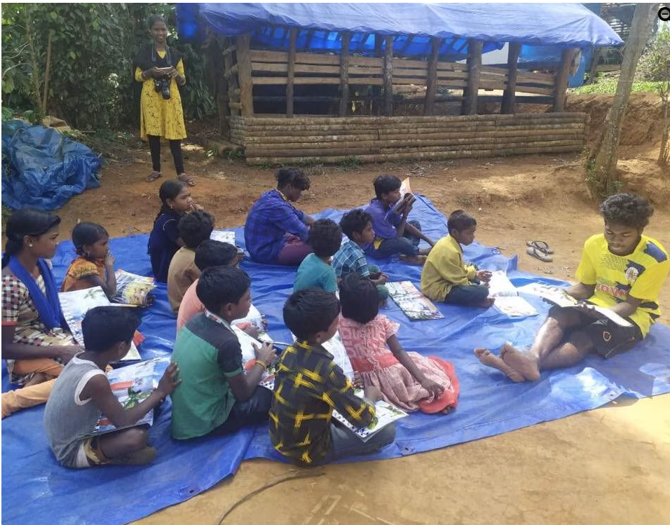
With the book

To truly understand the power of a book, all one needs to do is look at the English book, Our Forest Dream , launched on December 1, 2020. At the onset, it might seem like a simple book about a conversation between a grandmother and a granddaughter, but it's actually about The Scheduled Tribes and Other Traditional Forest Dwellers (Recognition of Forest