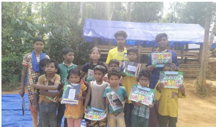
Children with the book