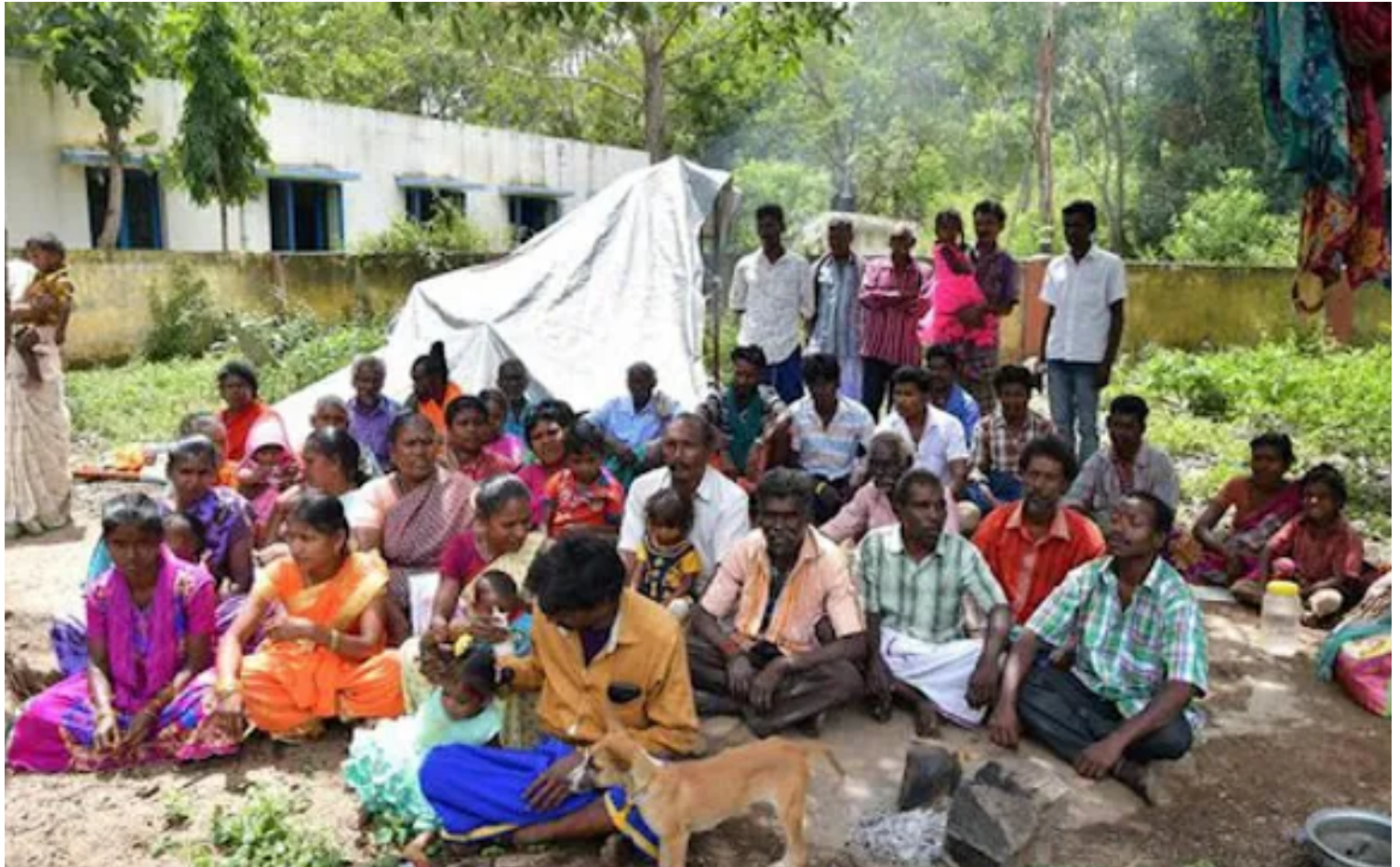
The Paliyar Tribe of Tamil Nadu