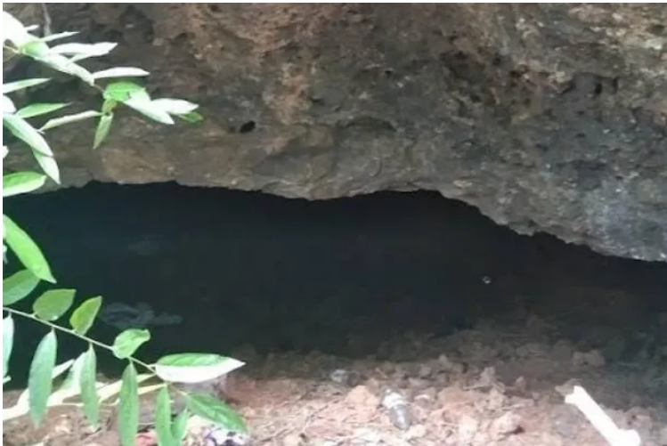
Stone cave, used by the Paliyars for shelter

As the Paliyars generally lived in the hills, they took shelter in big stone caves in the mountains. They also used mud caves in the absence of stone caves. The Paliyars generally lived in groups. Each group had a committee headed by a leader responsible for all important decisions. However, the mark of a good leader was to listen to the advice and opinions of everyone on the team. This team/committee also consisted of women.