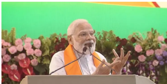
Modi speaking during ‘Mera Booth Sabse Majboot’ campaign in Bhopal.

Tribal leaders felt that while the impact of UCC on minority communities was being discussed threadbare, its effect on the indigenous people has not been