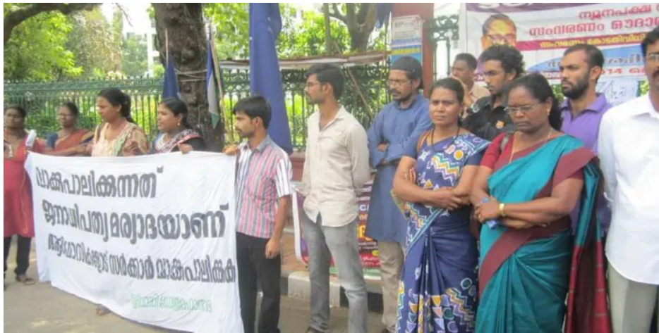
Leaders of Adivasi Gothra Mahasabha in protest to secure tribal rights during 'Nilppu Samaram' in Thiruvananthapuram