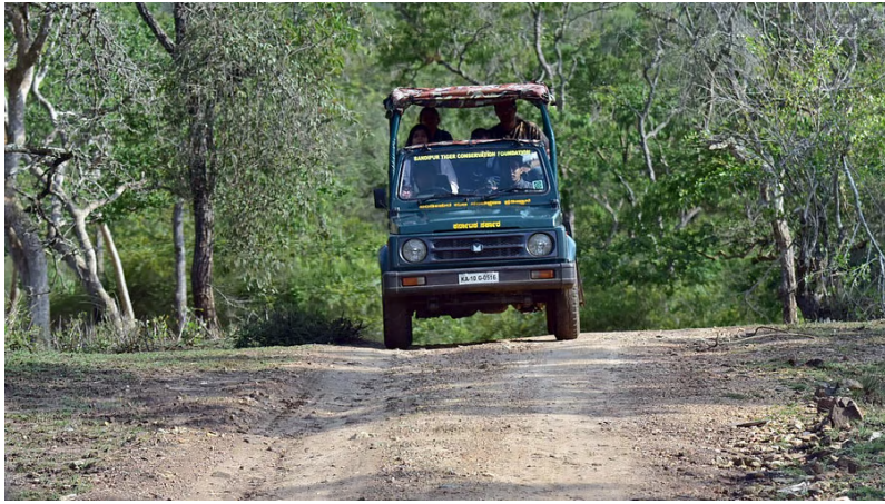
Tourists on a safari in Bandipur forest.

Mysuru: Tourism stakeholders and resort owners around Kabini backwaters, and the Nagarahole and Bandipur Tiger Reserves said the safari ban in Bandipur and Nagarahole has dealt a major blow to the region's tourism sector and the local communities dependent on it. They urged authorities to lift the ban at the earliest by formulating SOPs(Standard Operating Procedures)